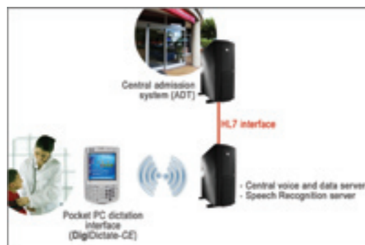
Interfaces between the central admission system, speech recognition server and PDAs.

Dr. Rosenthal's vision is simple and logical: "We introduced PDA devices that interface with the emergency and patient index system, as well as the speech recognition server. Physicians can now access up-to-date patient data (bed location, priority, chief complaint, etc.) and record their findings all from one single device."