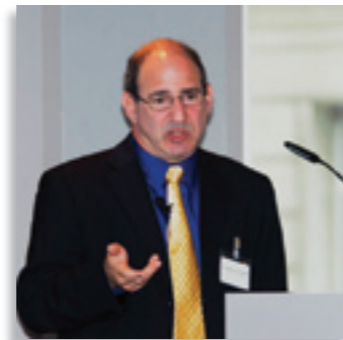
Speaking at the Philips partner event. A North American first, internationally acclaimed.